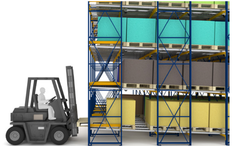
Charging the System