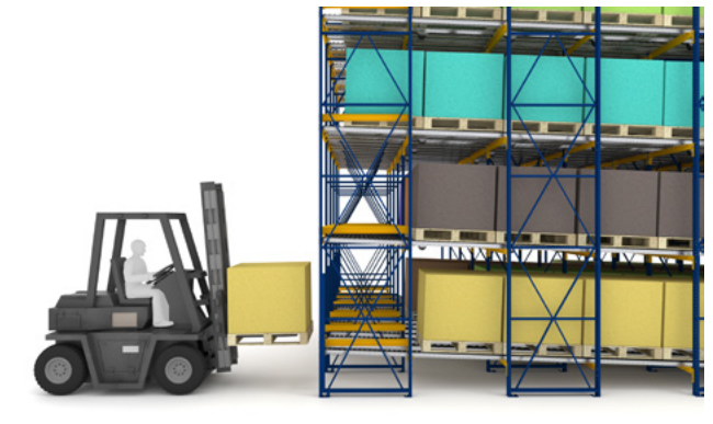
Follow the same process to load the remaining pallet positions