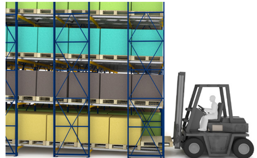
Plugging the System