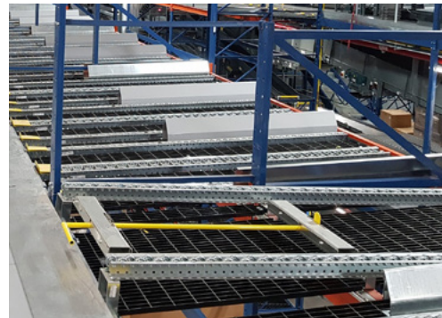
Empty Pallet Return - Pallet Separator