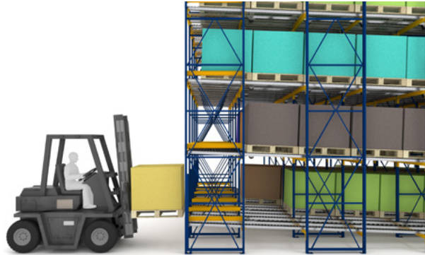
Square the forklift with lane & raise the pallet 3" above the rails