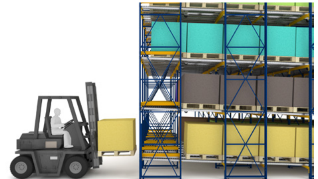
Follow the same process to load the remaining pallet positions