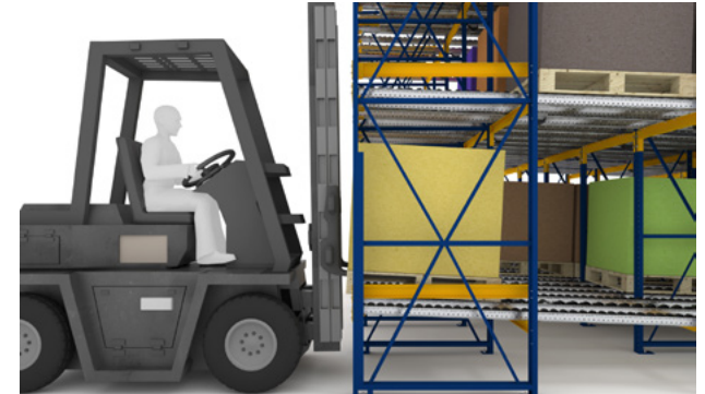
Place the pallet centered in the lane & tilt onto the rails