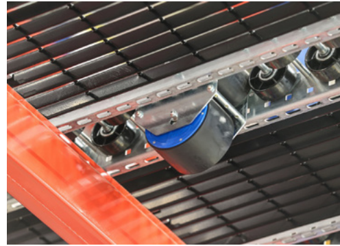
Indirect Mount Speed Controller

Ramp Stops - heavy-gauge steel ramp stops at the end of the pallet flow lane help bring the pallet to a safe stop and contain it in the lane until removed by personnel or forklift. Ramp stops are bolt-on and can be replaced if damaged without replacing the full rail.