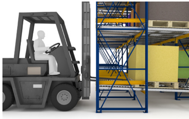
After placing the pallet, slowly back out of the lane